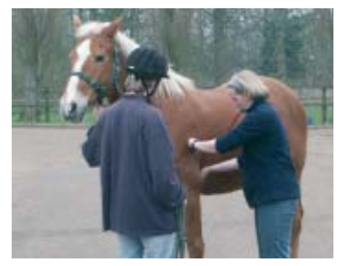
Vetting a horse before purchase is not a guarantee, but well worth the expense involved.

It may seem like just another expense at the time, but the importance of asking an experienced veterinary surgeon to examine a horse prior to purchase cannot be overestimated. Even an indestructiblelooking cob that is only going to be used for hacking out could have a huge number of existing or potential problems lurking beneath the surface. By having the horse vetted, you will not only be reassured that it is generally problem free, but that its conformation and general health does not predispose it to particular problems which could lead to untimely retirement. Of course there are never any guarantees, but