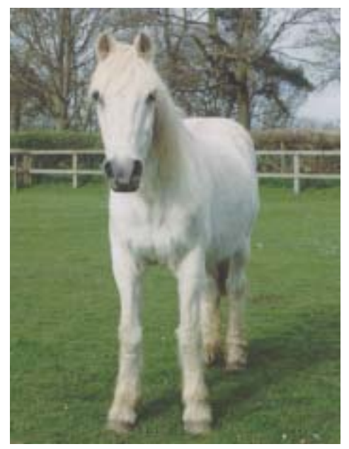
Jacko, still enjoying life at 39.

As veterinary science advances and develops new treatments, horses are able to live longer than ever before. Although the specific age an individual will live to is dependent on many things, including breed, conformation, background and living environment and can never be predicted, any new owner should be prepared for their horse to live past thirty. Even finer breeds such as Arab and Thoroughbred can be healthy and active in their thirties and