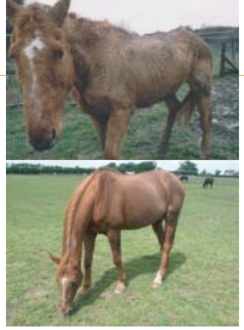
Top, letting a retired horse lead a more natural life should not mean neglecting it. Below, the same horse after just three months of routine care at Redwings.

Increasingly, there are more livery yards opening around the country which specialise in caring for retired equines. This solution will still involve significant financial commitment, but has the benefit of continued control over decisions made with regard to the care of the horse and the reassurance of a professional service if the establishment is carefully selected and checked out.