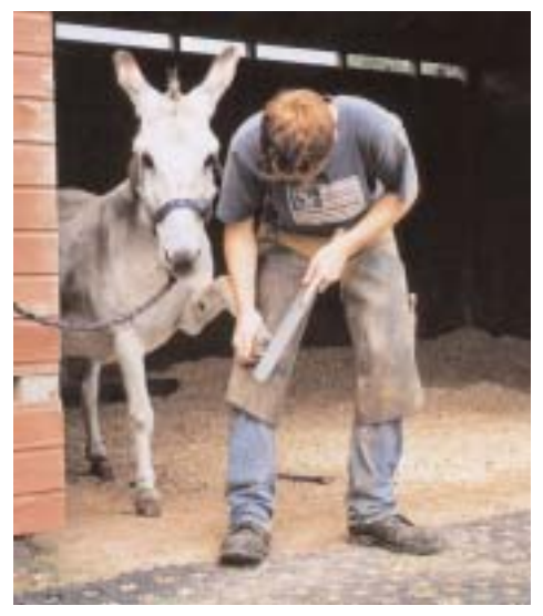
Retired equines must have all their needs met to keep them happy and healthy.

Many people find the cost of keeping a horse they cannot ride prohibitive, particularly if they have to rent stabling and grazing, or are keen to take on another equine with which to continue riding or driving. Very few owners can be lucky enough to secure a place for their horse in a sanctuary and most have to make a difficult decision regarding their animal's long term future. There are a few options worth considering and looking into carefully.