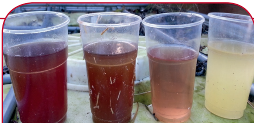
URINE SAMPLES WITH INCREASING AMOUNTS OF MYOGLOBIN PIGMENT (NORMAL SAMPLE ON RIGHT)